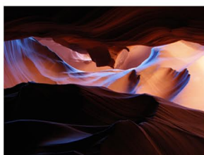
Beautiful glow inside the canyon