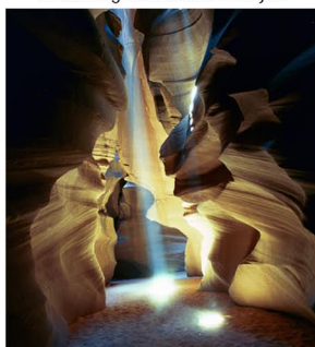
Light-shaft in second chamber