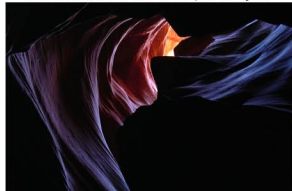
Purple and Blue colors