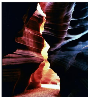
Colors vary from red, orange, purple, and blue