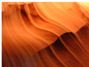
Beautiful Navajo Sandstone, great example of cross-bedding throughout the canyon

Travel in a 4-wheel drive vehicle that is both rugged and safe yet comfortable. You enjoy a scenic ride to the canyon where the guide explains geology, cultural history and modern issues.