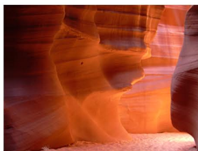
Reflective light producing orange glow inside the canyon's first room